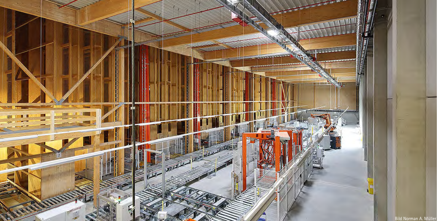
Constructed in line with ecological principles, the high-bay warehouse can accommodate 31,392 pallets.