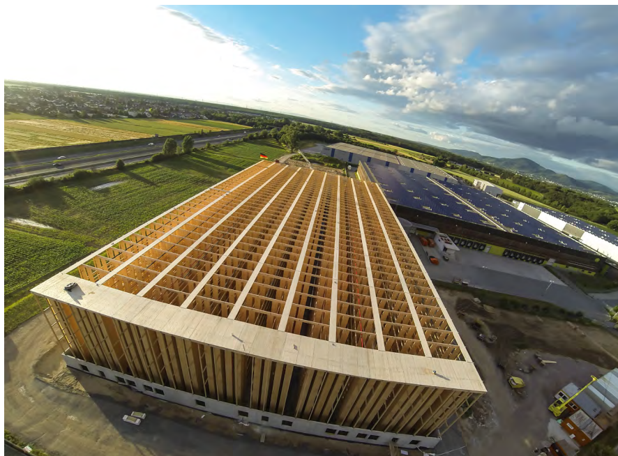
Alnatura's high-bay warehouse in Lorsch is built from certified wood.

"Alnatura – good for people and the earth."