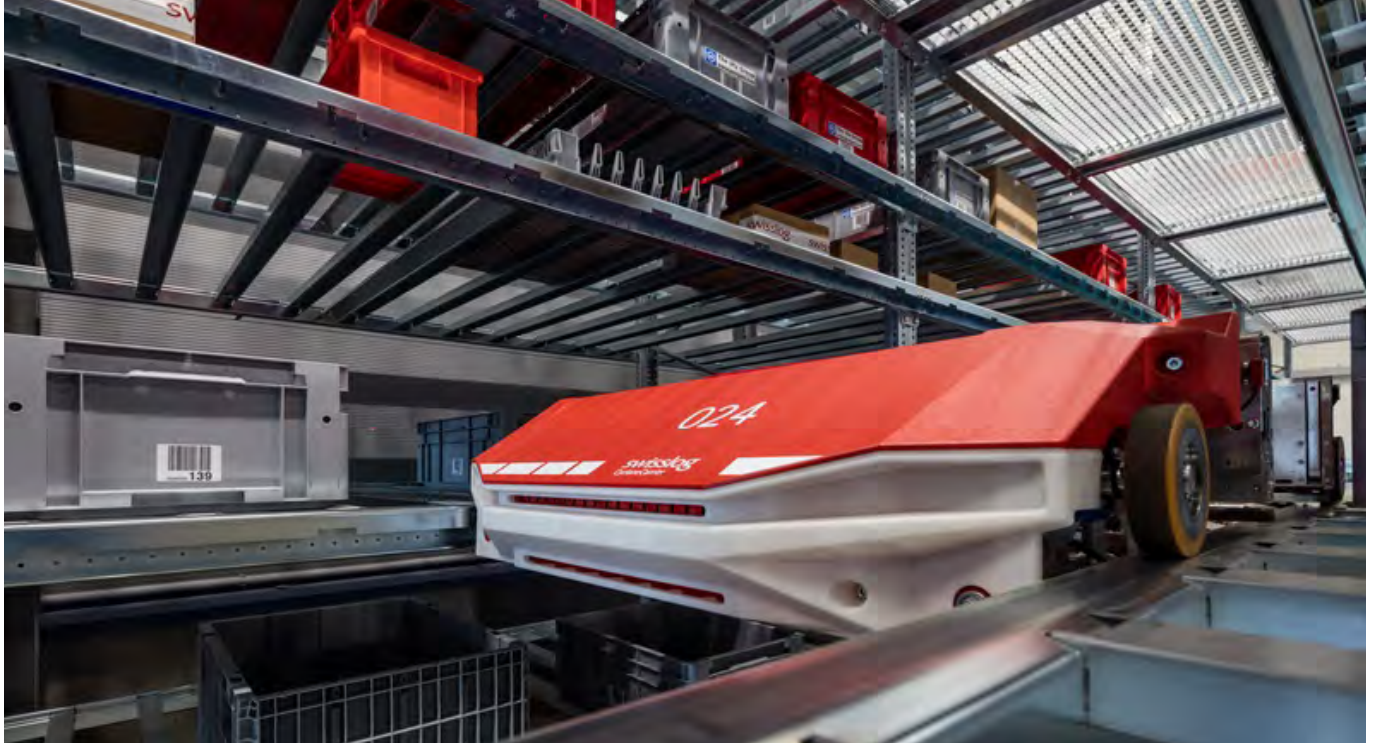
CycloneCarrier in use: The high-speed shuttle travels at up to 4 m/s