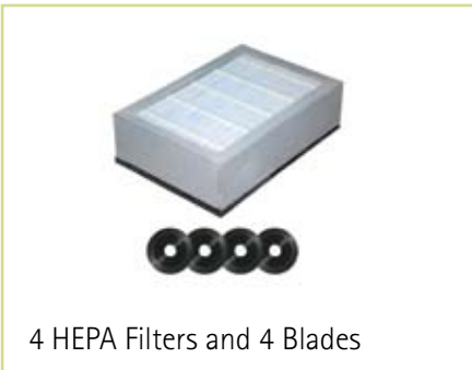
4 HEPA Filters and 4 Blades