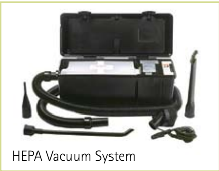
HEPA Vacuum System

Due to ongoing improvement programs, Swisslog reserves the right of production or design change without notice or obligation.