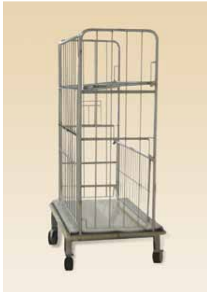
Open Style Bin-Forming Cart

Bin-forming carts enable highly efficient transport from clean deliveries to soiled returns for linen/laundry and supplies/trash. Shelves support clean materials when en route to clean holding rooms on patient floors. Once empty, the shelves are moved into the side position, forming a bin for the return of soiled materials. Wire lattice or fiberglass bin-forming carts are processed through a cart washer before reuse with clean materials.