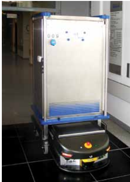
Hot Meal Cart

Food carts are designed for specific food service systems, allowing the kitchen to deliver meals to patient areas—whether it be room service, hot food tray line or retherm (cook/chill) operations. Food carts are either tandem (1/2 size for transport of 2 at a time) or full size, and can serve dual purpose by returning soiled dishes to the kitchen.