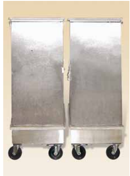
Tandem Carts (transport 1 or 2)