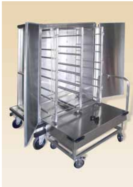
Shuttle System Case Cart

Shuttle systems can reduce the quantity of enclosed carts required and increase operational efficiencies. Supply carts are available in either tandem (1/2 size) or full size.