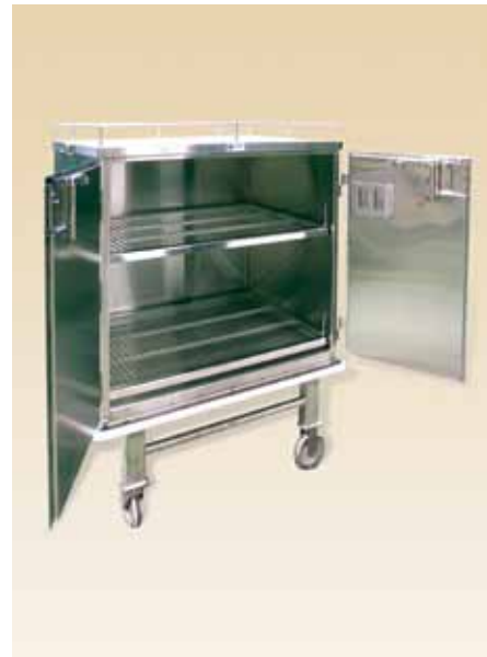
Sterile Supply/Pharmacy Cart