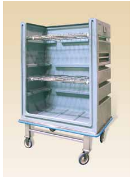
Fiberglass Bin-Forming Cart