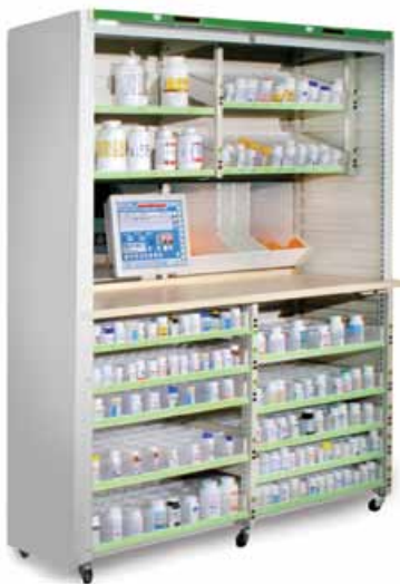
Workstation & Modular Storage