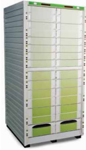
High-Density Drawer Module