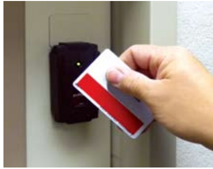
Optional WhoTube™ Technology