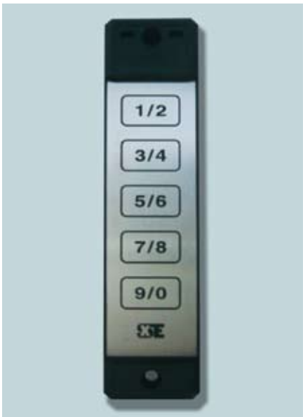
Electronic Combination Keypad for Stations not Using I.Q. Control Panels