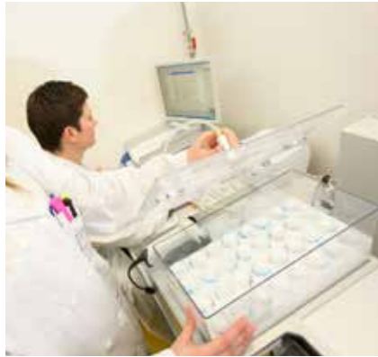
1. Pharmacy technician fills the medication canisters and a pharmacist cross checks