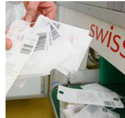
10. Therapies are transferred to patient floor either manually or with automated transports solution by Swisslog. Our Pneumatic Tube Systems and Automated Guided Vehicles deliver items quickly and reliably, reducing manual labor and waiting times.