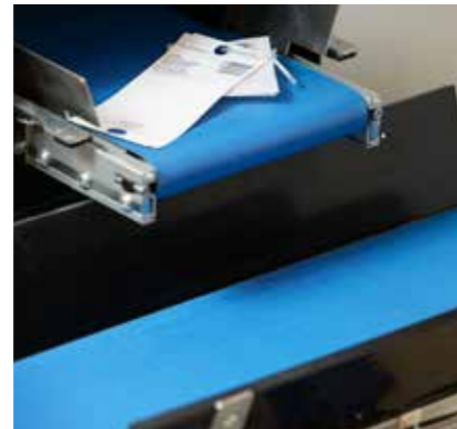
9. PickRing dispenses the therapy to a ward box for Cart Refill or into a high priority box for STAT medications