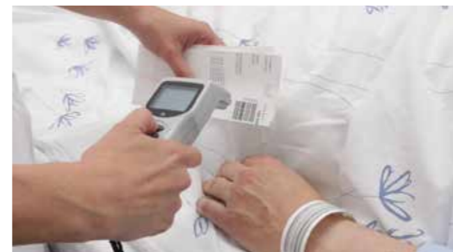
3. Verify therapy barcode and administer medications to patient