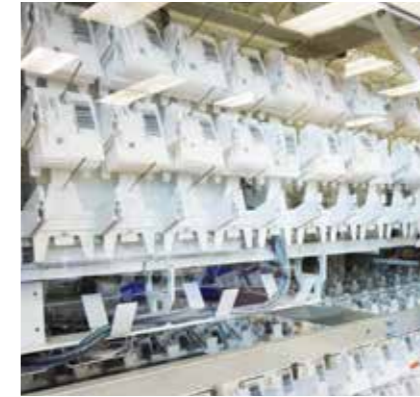
5. Unit doses are transferred to storage, stock levels are automatically updated and controlled