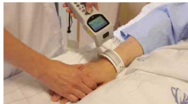
2. Verify patient barcode