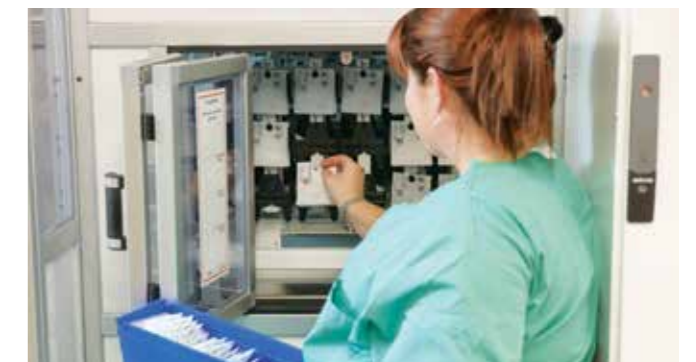
4. Return unused medications to PillPick