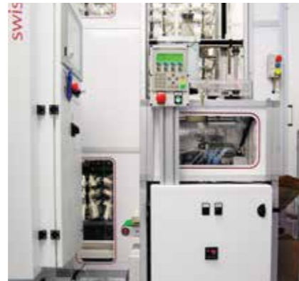
8. PickRing adds the patient label, verifies the doses and assembles daily patient-specific therapy