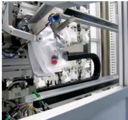
7. The SinglePill Robot picks the unit doses according to the received prescriptions