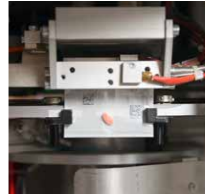
4. With PickView (optional vision system) all broken, duplicate or incorrect medications are discarded