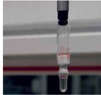
3. PillPick picks and packages most drug typologies