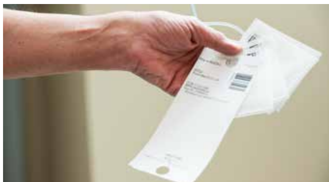
1. Locate PickRing and bring to patient