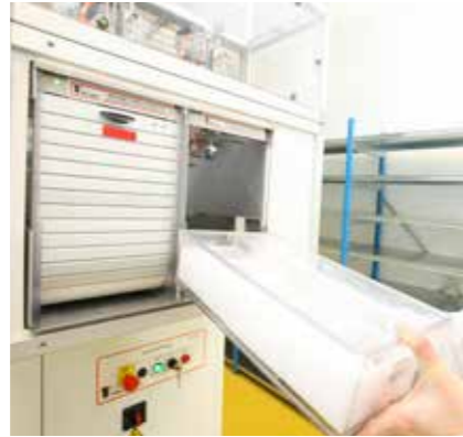
2. Pharmacy technician loads canisters with medication into the system